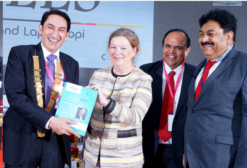
President IAGES receiving the IGELS Membership

It was a fitting and a grand Launch for IGELS and from University Clinic of Freiburg we had received